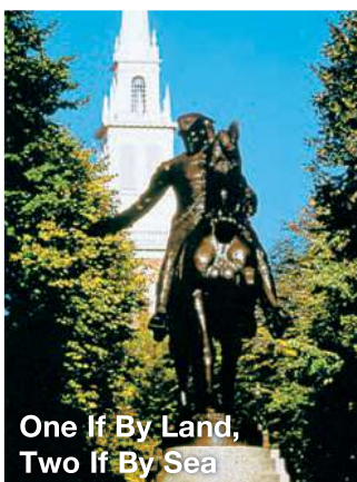
One If By Land, Two If By Sea